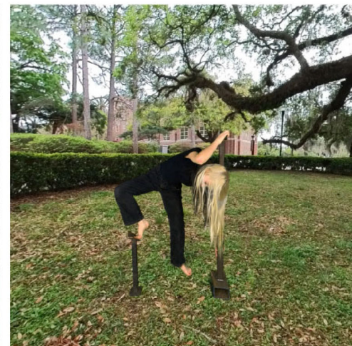
Infrastructure by Chelbi Robinson