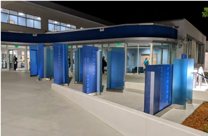
“Building Up Community” by Krivanek+Breaux. 2020