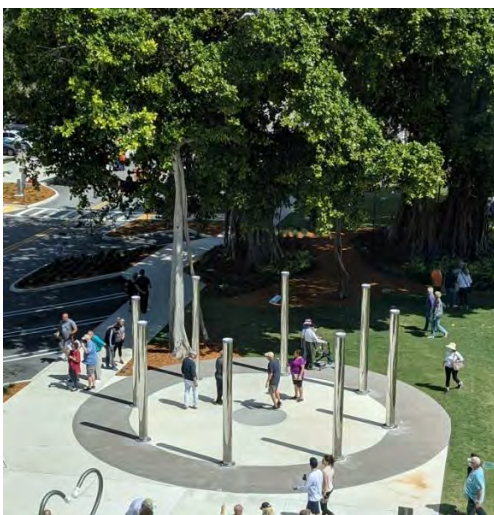
“Synesthesia” by Donald Gialanella Sound and Light Interactive Space, 2020