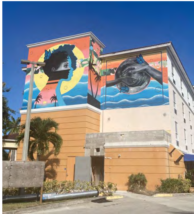
NB Hospital by Koco Collab, 2022