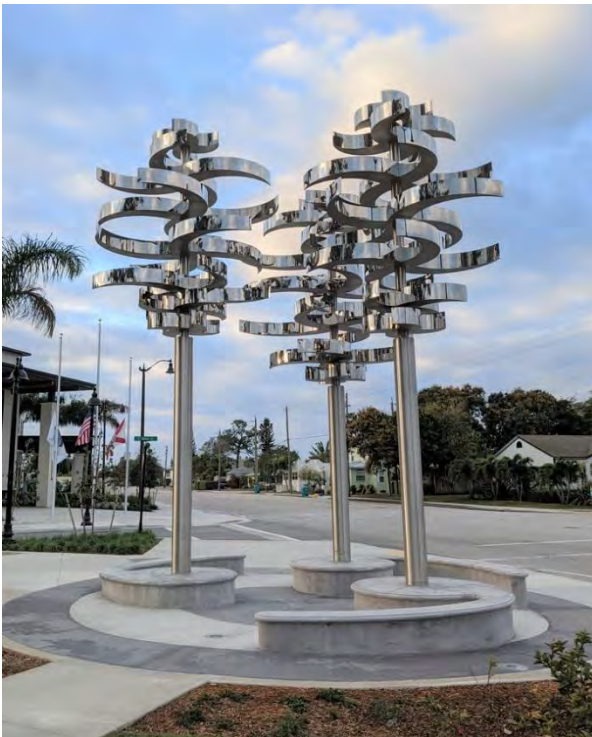
“Reflections” by Ralfonso, 2020